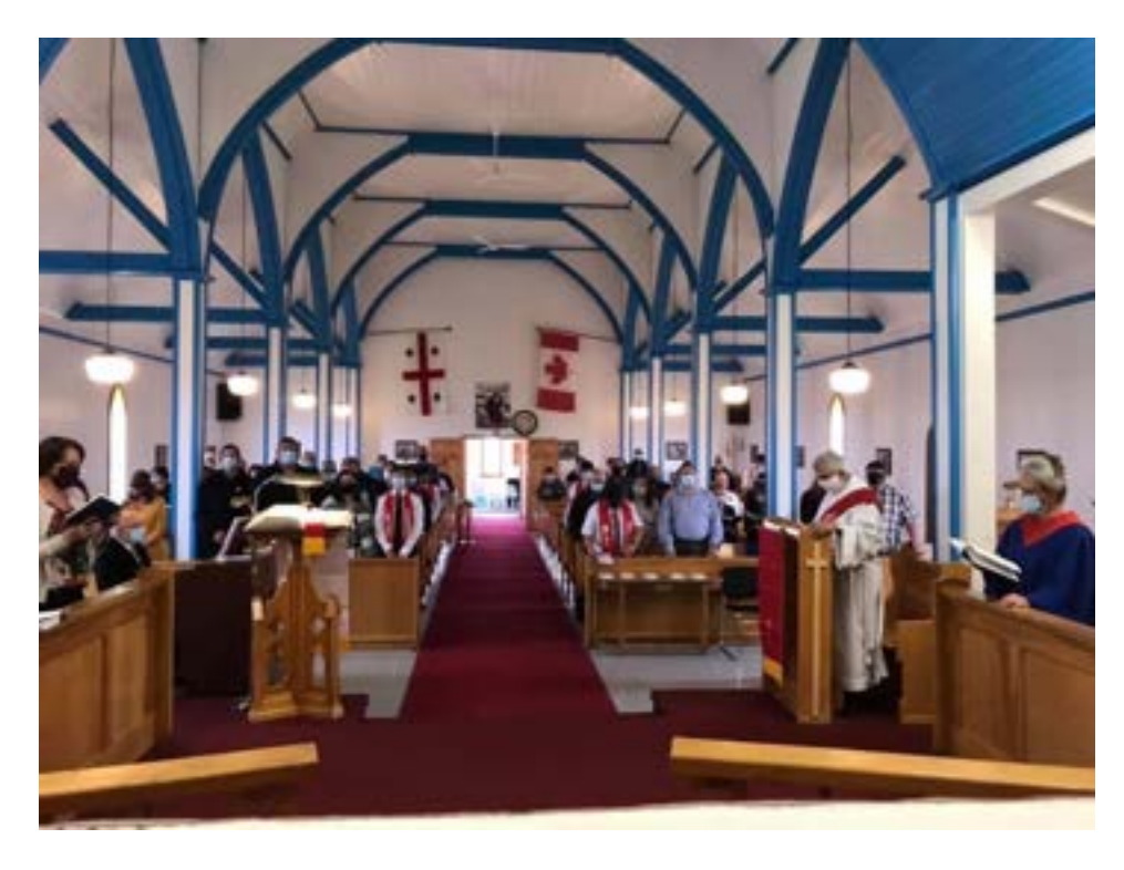
Church of The Holy Spirit, Isle aux Morts)